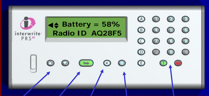
Scroll Keys Send/Enter Backspace Alpha, Numeric and T/F Keys Setup Key

AAA batteries used to keep future costs down. Diagnostics include Battery level %